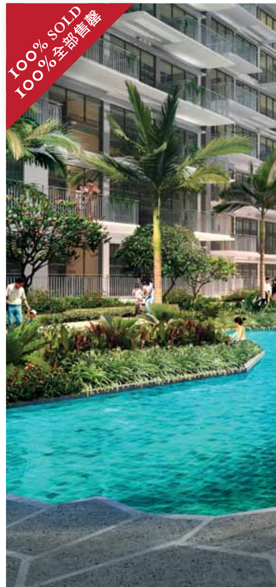
Artist's Impression 設計意念

於二零一二年五月，我們與合作夥伴Kay Lim Realty Pte Ltd及Amara Holdings Limited之附屬公司Creative Investments Pte Ltd以投標價233,500,000新加坡元，投得位於十八區Tampines Central 7/Tampines Avenue 7/Tampines Avenue 9之地塊，以於新加坡發展共管公寓項目。我們計劃於48個月內在該佔地20,750.5平方米、地積率2.8倍的地盤，興建500至600個單位，而租賃年期為103年。該項目位處充滿活力的社區，四周時尚生活中心一應俱全，坐擁天然風光，而且毗鄰購物設施，如淡濱尼廣場、Tampines One及Century Square，鄰近St. Hilda's、Gongshang及Poi Ching Primary School等學校，以及公園，如Tampines Eco Park、Sun Plaze Park、Bedok Reservoir Park及即將落成的Integrated Lifestyle Hub，並可通過ECP、PIE、TPE、淡濱尼地鐵站(Tampines MRT)及未來3號地鐵市區線之轉車站(Downtown Line 3 MRT Interchange)直達。