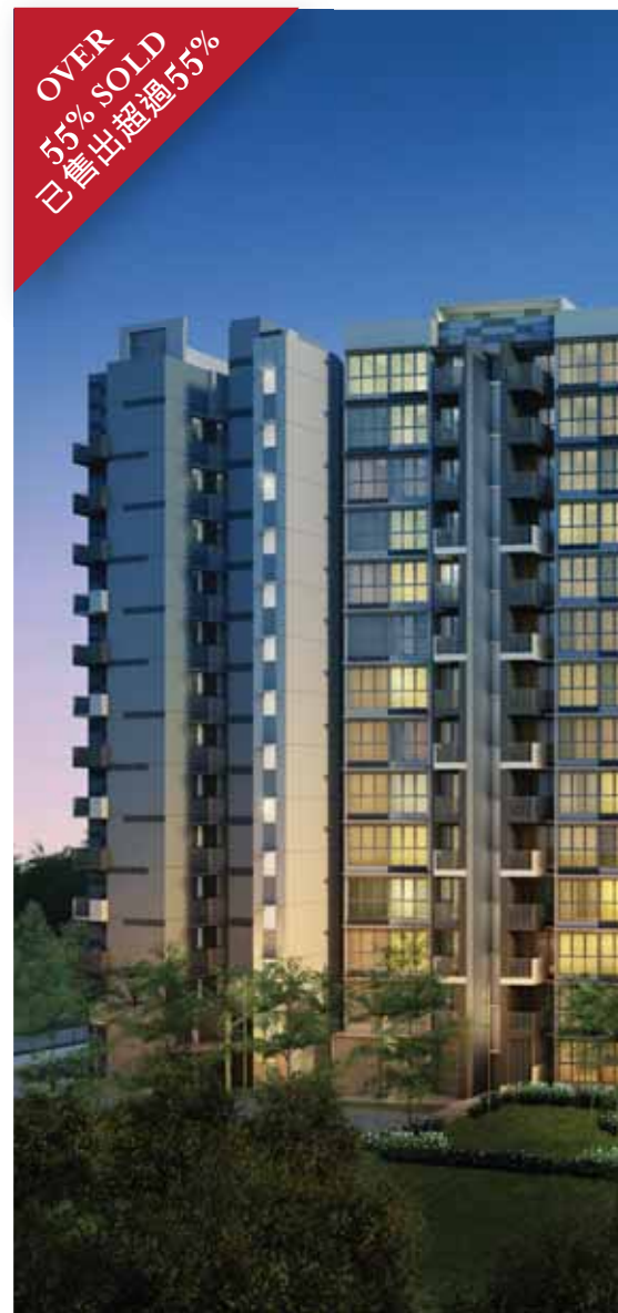
Artist's Impression 設計意念

SingHaiyi Group Ltd. (前稱SingXpress Land Ltd.) 已著手展開本集團最近成功投得、價值123,900,000新加坡元的設計、興建和銷售計劃項目。該項目位於Pasir Ris Central，佔地16,388.2平方米，最高可建樓面面積為40,970.5平方米(2.5倍地積率)，預期建設447個單位。發展計劃包括四幢13/14層高的設計、興建和銷售計劃項目，備有三房、四房及五房單位以供選擇，另設有育兒中心、停車場及所有附屬設施。項目完工期為48個月，租期為103年。發展地盤位處Pasir Ris市中心的黃金地段，鄰近多種社區設施，包括Pasir Ris Town Park、購物中心、中小名校以及Pasir Ris地鐵站、Pasir Ris巴士中轉站及主要高速公路。