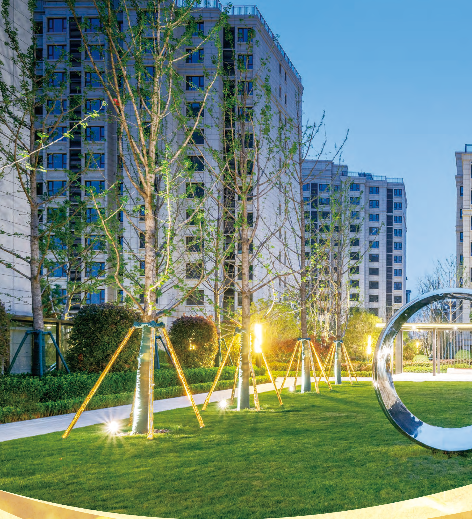
Zhengzhou Zensun Princess Lake 鄭州正商公主湖