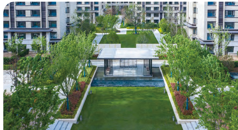
Zhengzhou Zensun River Valley 鄭州正商河峪洲