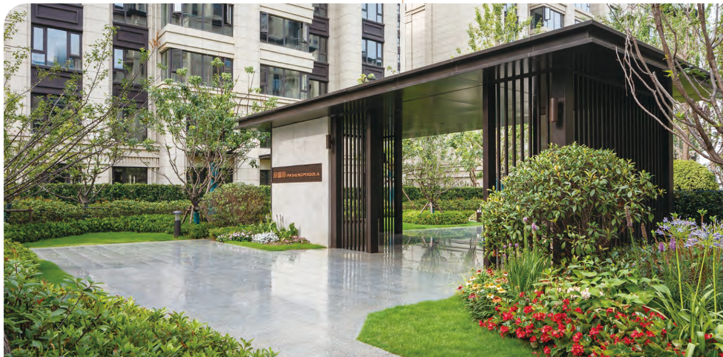
Zhengzhou Zensun Orchids Mansion 鄭州正商蘭庭華府