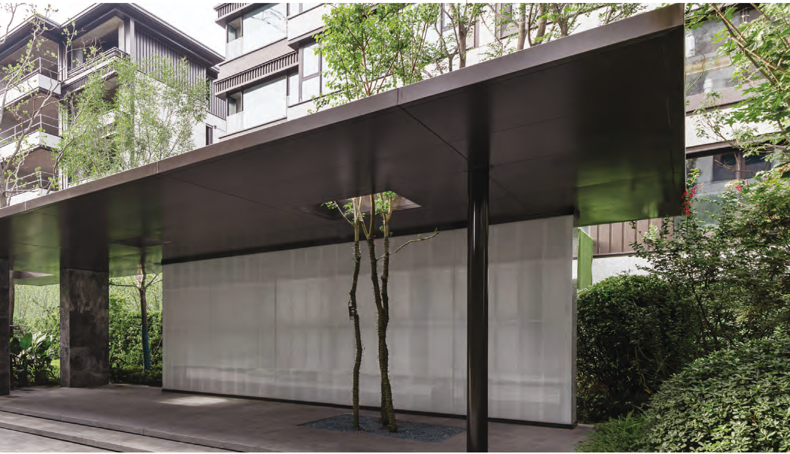
Zhengzhou Zensun Zhenruishangjing 鄭州正商禎瑞上境

Looking forward, based on the overall situation of the real estate industry and in order to improve its risk prevention capability, the Group will focus on Zhengzhou in Henan Province with a view to ensure the continuity of the Company's operations and upon in-depth research and careful planning, and continue to expand its land reserve by selecting projects with fast development and high gross profit margin to ensure that the Company will continue as a going concern and develop in a sustainable manner.