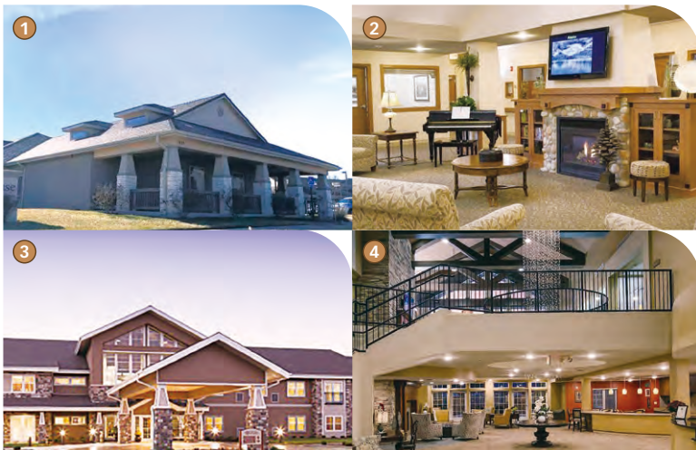
1&2. Glen Carr House, senior housing community