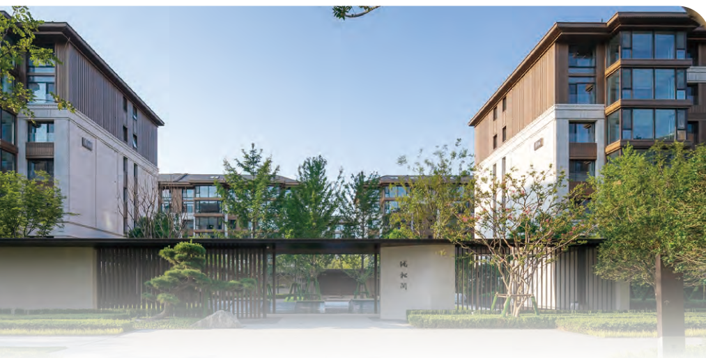
Zhengzhou Zensun Longshuishangjing 鄭州正商瀾水上境

Zensun Enterprises Limited (the “Company”) was founded in 1965 and listed on the Main board of the Stock Exchange of Hong Kong since 1972. The Company has been included as a constituent for the MSCI Hong Kong Small Cap Index in May 2021 and as a constituent for the Hang Seng Composite Index in March 2022 respectively. The Company and its subsidiaries (collectively, the “Group”) primarily engages in property development, property investment, project management services and securities trading and investment in Hong Kong, The People's Republic of China (the “PRC”) and overseas.